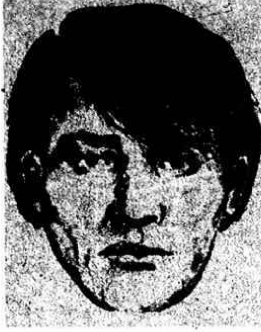
suggests he may be the Son of Sam suspect in the police sketch at right.